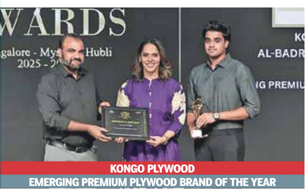
KONGO PLYWOOD EMERGING PREMIUM PLYWOOD BRAND OF THE YEAR