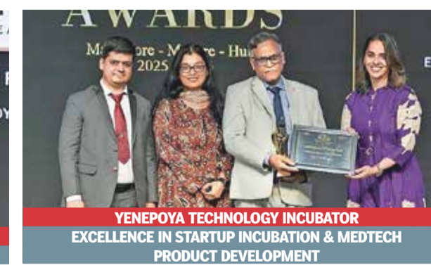
YENEPOYA TECHNOLOGY INCUBATOR EXCELLENCE IN STARTUP INCUBATION & MEDTECH PRODUCT DEVELOPMENT