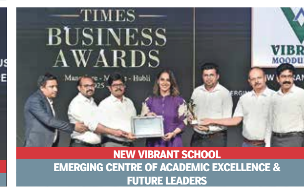
NEW VIBRANT SCHOOL EMERGING CENTRE OF ACADEMIC EXCELLENCE & FUTURE LEADERS