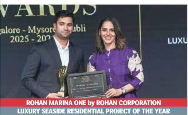
ROHAN MARINA ONE by ROHAN CORPORATION LUXURY SEASIDE RESIDENTIAL PROJECT OF THE YEAR

Note: Present survey has been conducted by an independent Research Agency named Avance Insights Pvt Ltd, a full-service market research agency providing Research and Support Services to companies ranging from boutique research agencies to large consulting firms.