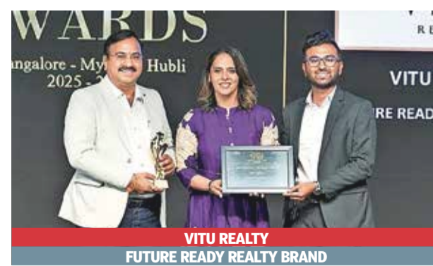
VITU REALTY FUTURE READY REALTY BRAND